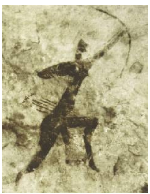
An ancient cave painting from Tassili n'Ajjer, a mountain range in the Algerian region of the Sahara.

All though ballistics studies may appear to be a relatively new field of research; it is as old as man himself. One of the first technological breakthroughs in arms was the invention of the bow and arrow. Early bow hunters took effective game killing very seriously. The method in which the arrow killed was through its blades, which were as broad as practical, severing as many arteries in the animal's chest as possible to cause death through blood loss.