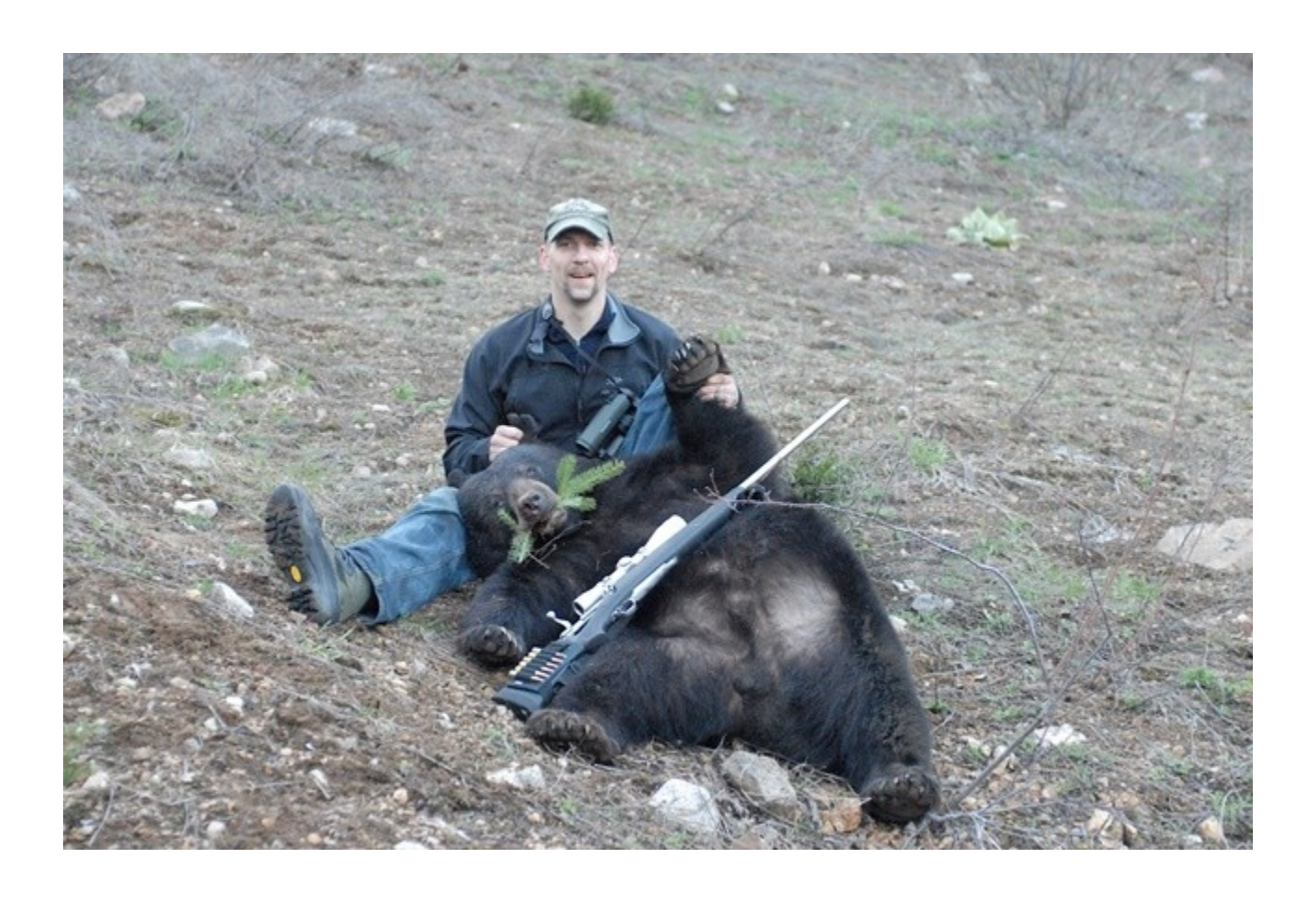
Use enough gun. The .338 Win Mag and controlled expanding 225gr Nosler Partition can be put to great work on bear. That said, shot placement is a key factor to effect extremely fast killing.

A heavy yet soft and frangible or partially frangible projectile (loses some weight) may not deliver hydrostatic shock very far depending on game body weights, but providing the cluster is dense enough, it will be capable of rendering deep, broad and highly traumatic wounding across a wide range of body weights. Good frangible bullet designs can continue to produce mechanical wounding and a measure of hydraulic shock down to impact velocities of 1600fps with some exceptional projectiles continuing to produce excellent performance down to velocities as low as 1400fps.