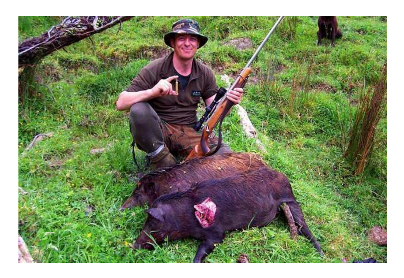
Wide, disproportionate to caliber wounding (hydraulic shock) thanks to the 162gr Hornady SST combined with high velocity which also caused hydrostatic shock (instant collapse).

misused by both hunters and professionals - including ballisticians working for bullet making companies.