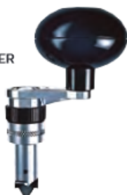
DELUXE QUICK-TRIM CASE TRIMMER

After a few loadings, cases tend to get longer. This could be dangerous if the case were so long that it would pinch the bullet in the end of the chamber. Pressure high enough to damage the gun could result. A convenient way to trim to the correct safe length is with the Lee Quick Trim Case Trimmer. Install the appropriate Quick Trim Die — and 5 quick turns of the crank will yield a perfectly trimmed and chamfered case. 90437 Deluxe Quick Trim